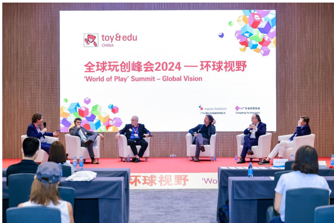
'World of Play' Summit returns this year with new global industry topics to explore.

Shenzhen, 31 March 2025. The stage is set for one of the most influential industry gatherings in South China. Opening next week, the joint platform will facilitate networking, collaboration, and growth in both domestic and global trade during the peak sourcing season for toys, baby products, and IP exchange. Scheduled from 7 to 9 April 2025 at Shenzhen World Exhibition & Convention Center, the three fairs are poised to welcome industry players from around the world for the comprehensive cross-sector trading event, enhanced by an impactful fringe programme featuring conferences, forums and networking sessions.